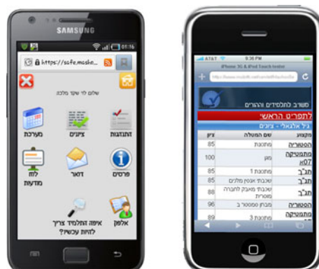
Fig. 2 Mobile application of MASHOV database for students and parents – interface and student data view

The effectiveness of a school database increases as more teachers enter student data on a daily basis and instantly connect with colleagues, students, and their parents (Blau and Hameiri 2010, 2012). Many Israeli classrooms, especially in the secondary