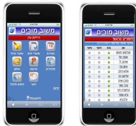
Fig. 1 Mobile application of MASHOV database for teachers – interface and class data view

The interfaces of application for students and parents (Fig. 2 on the left) shows icons of grades, behavior and function, student’s schedule, current lesson information, search function, notifications, a school email, list of classmates and of a school staff. Figure 2 on the left illustrate how a student or a parent monitor grades in different assessment types (exams, papers, homework) and different subjects.